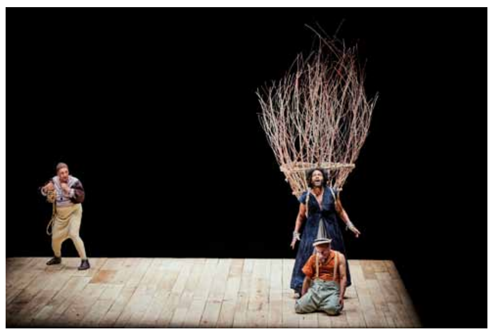
William Shakespeare: The Tempest . Translation, adaptation, direction, set design, costumes, sound and lights Alessandro Serra. Torino 2022.

but also by the people. At the same time, he reminds those in power to be vigilant because the people can support them as well as revolt against them if they pay no heed to the people.