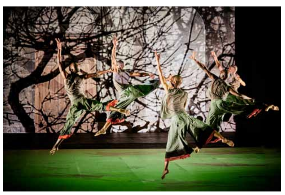
The Sacrifice. Choreography Dada Masilo. Johannesburg 2021.

its diversity and multiple identities through costumes (the dancers were dressed in recycled, loose, civilian clothes), the ballet ensemble gave a compact and synchronised impression.